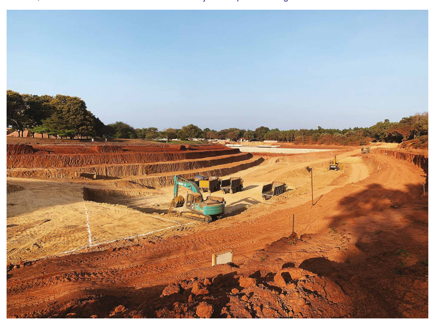
Excavation underway for Lake section 2

Running around the border of the gardens, between the gardens themselves and the rainwater harvesting channel, is the cobblestone Oval Road. We have just completed a long section from the North to the West